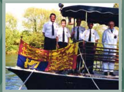
Private Charter - May 12th 2001 for Her Majesty the Queen