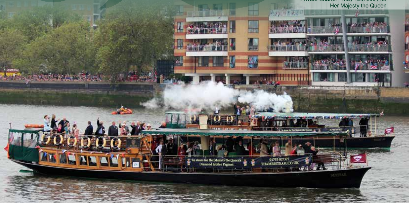
Steam launches Nuneham & Streatley Royal Squadron - Her Majesty the Queen's Diamond Jubilee Pageant